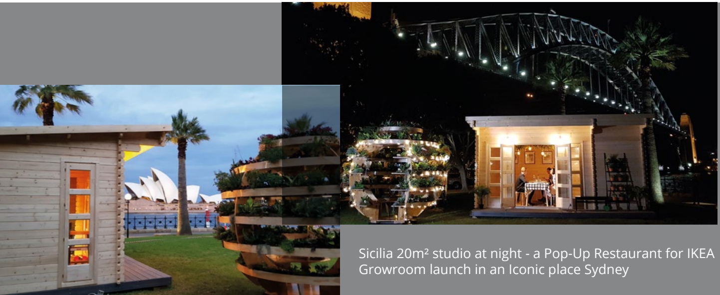
Sicilia 20m 2 studio at night - a Pop-Up Restaurant for IKEA Growroom launch in an Iconic place Sydney

Over 30 years of operation, the factory has delivered more than 150,000 various sized buildings including residential homes, commercial buildings, backyard cabins and sheds. Producing and delivering not only to Scandinavia or other European countries like the UK, Germany and Holland but also to Australia, New Zealand, USA, Japan, China makes processes easy. From designing homes following the market specifics to a safe and sound delivery through long distances are well-known processes mastered during the years.